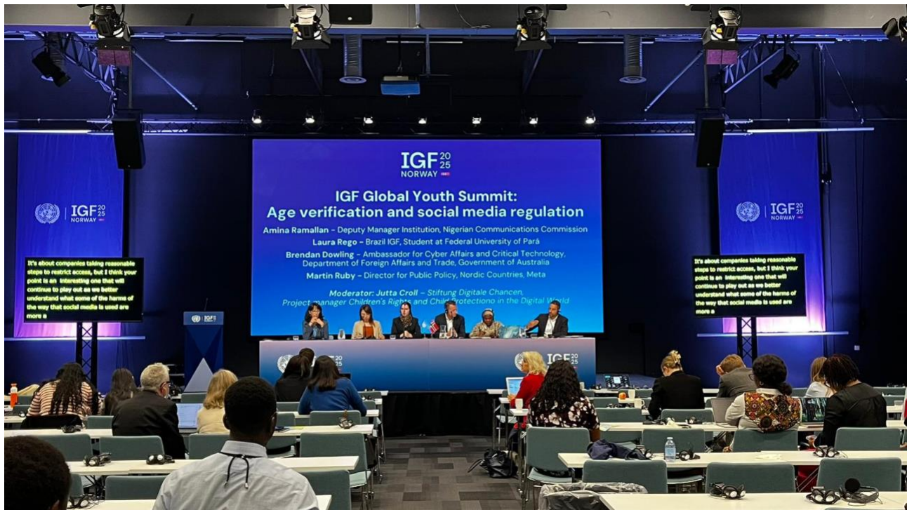
IGF 2025 Global Youth Summit in Lillestrøm, 23 June

through age verification, unpacking various aspects of AI governance and engaging over thousands of young people.